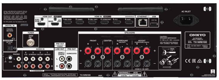
Text on receiver may vary with regio

Power cord • Indoor DAB/FM antenna • AM loop antenna Speaker setup microphone • Quick Start Guide • Remote controller AAA (R03) batteries x 2