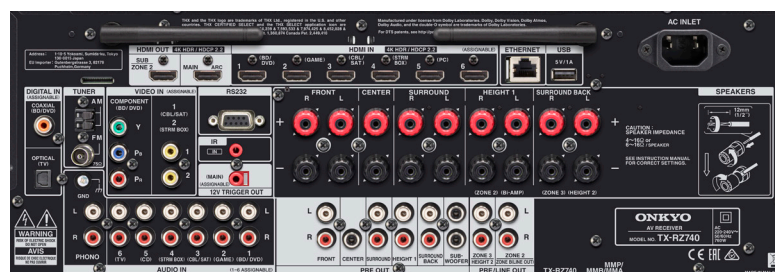
Text on receiver may vary with region.